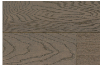
Earl Grey (Oak)