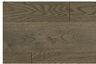
Matcha Tea (Oak)