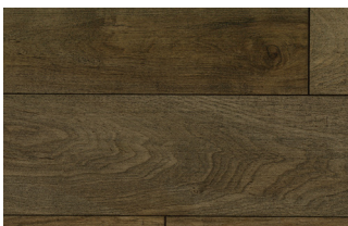
French Roast (Maple)