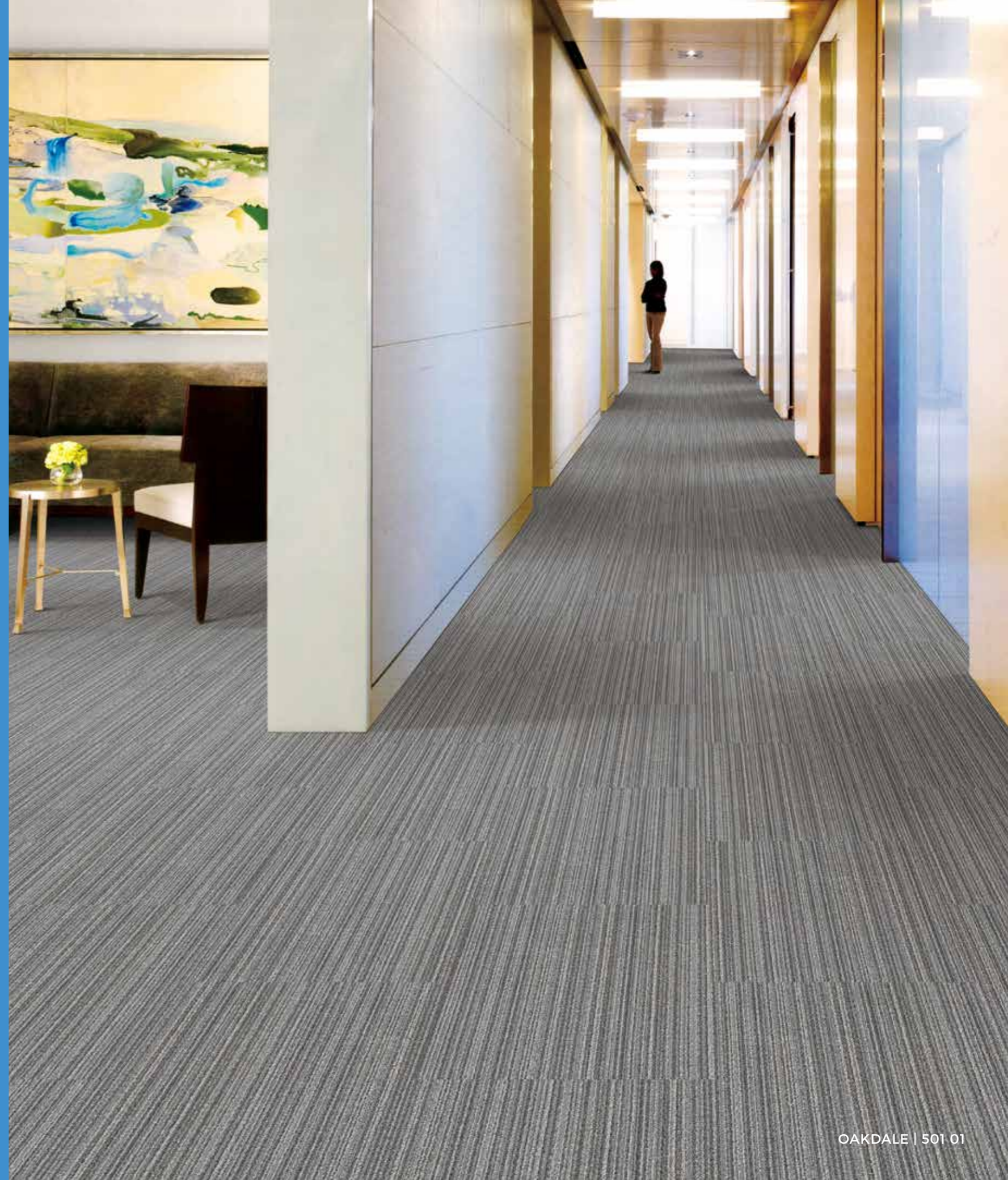
OAKDALE | 501 01