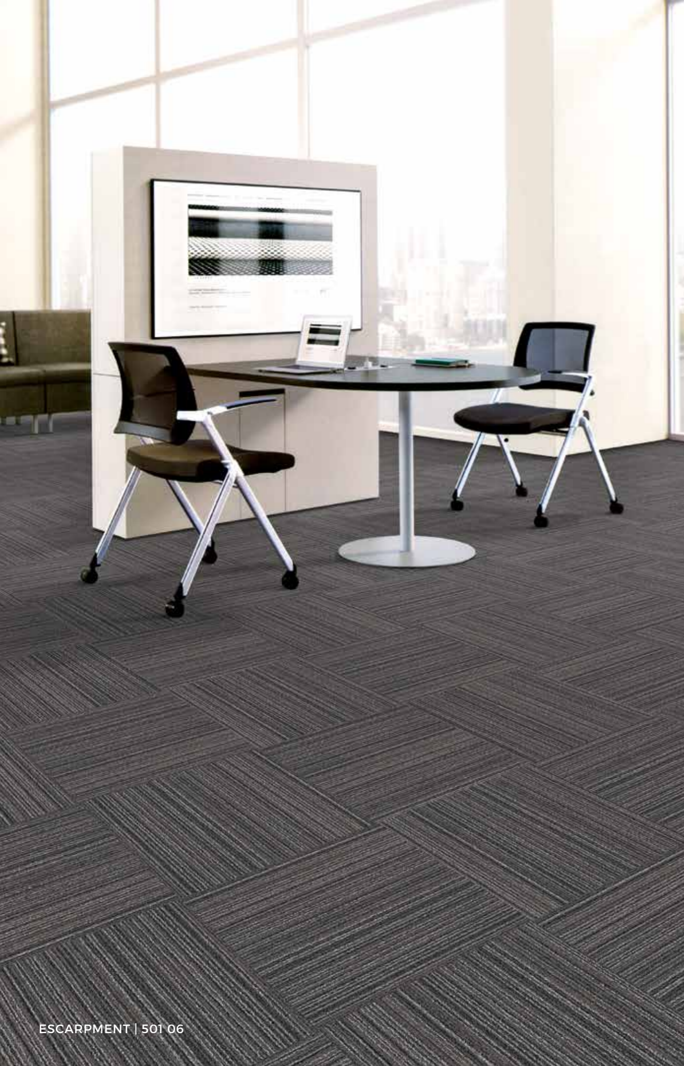
ESCARPMENT | 501 06