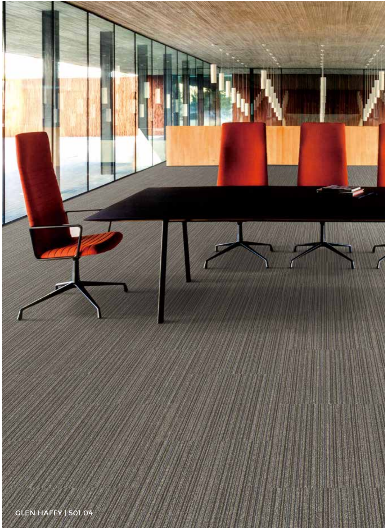
GLEN HAFFY | 501 04